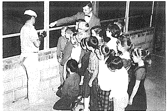
Children watching work in progress at Hanover School