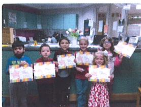
Mrs. Schroeder's Super Sight Word Readers