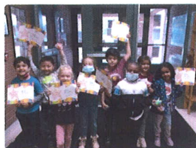
Ms. Liner's Super Sight Word Readers