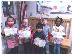
Miss Lionello's Super Sight Word Readers