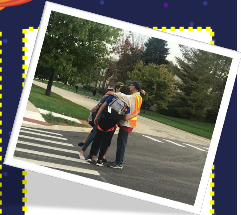
Hugs for our FAVORITE crossing guard!