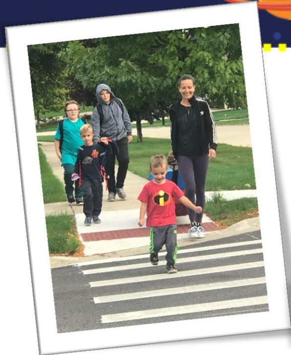
Love seeing our families with smiles on their faces for school!