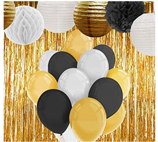
Golden Gala Prom

Prom will be held at Stonegate Conference and Banquet Center in Hoffman Estates. Doors will open at 6:00pm and close for entry at 7:30pm. Students must be dressed in appropriate formal attire. There is a zero tolerance for alcohol or illegal substances. Students must bring their ID's as it is their ticket into the dance. Students with a guest must make sure that the guest brings a photocopy ID as well. Students on LOP will not be allowed into the dance.