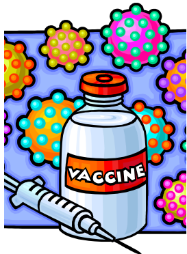
Don't forget to get your shots for the new school year!

All Centennial students are required to have 2 (two) MMR. Students entering Kindergarten and 6th grade need 2 (two) Varicella (chicken pox) vaccines for the 2014-2015 school year. Students will NOT be allowed into school without proof of these vaccines.