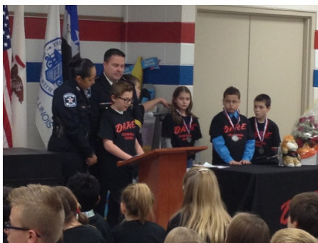
DARE Essay Winners