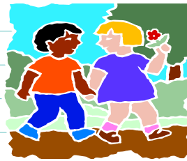
18th Walk-A-Thon Support our School

Please come to the first PTC meeting on Wednesday, September 2 at 7:00pm in the Multi-purpose room to learn more about what our PTC will be doing this year and how you can become involved.