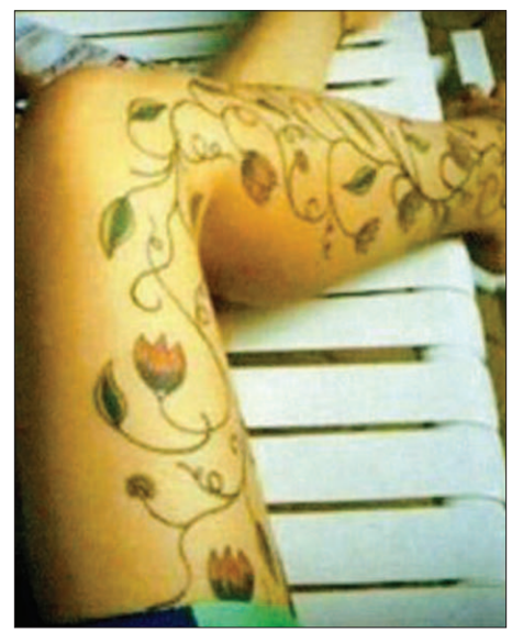
Rezab's distinctive leg tattoo.