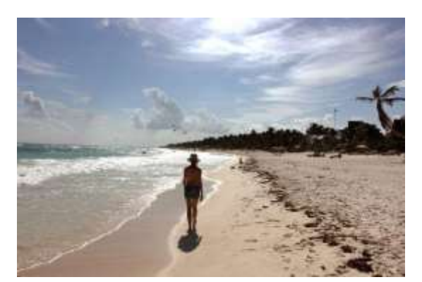
As a public service, Shaw Media will provide open access to information related to the COVID-19 (Coronavirus) emergency.

Officials at suburban schools are concerned about students' increased risk of exposure to the novel coronavirus over spring break from what they and their families might bring back from their travels.