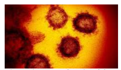
COVID-19, or coronavirus, as it appears when viewed through a lab microscope.

Libraries are closed and Catholic Mass 'dispensations' offered By Rafael Guerrero