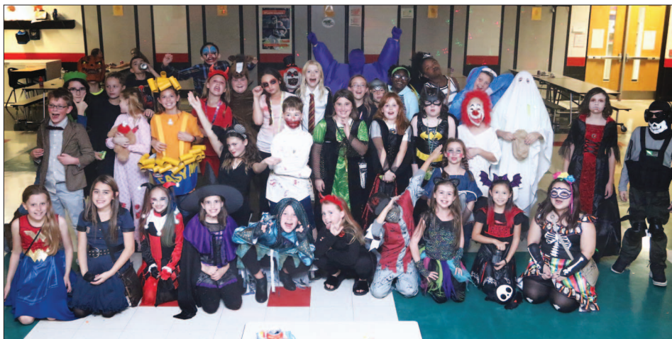
Girls and boys wore a frightening and funny variety of costumes.