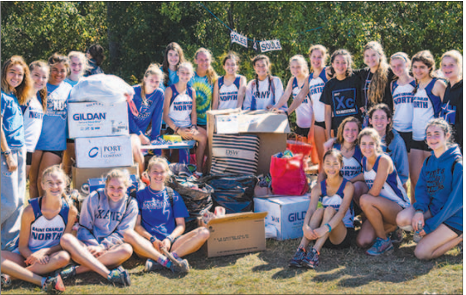
Members of the North girls cross country team that worked to collect shoes for donation to Soles for Souls.