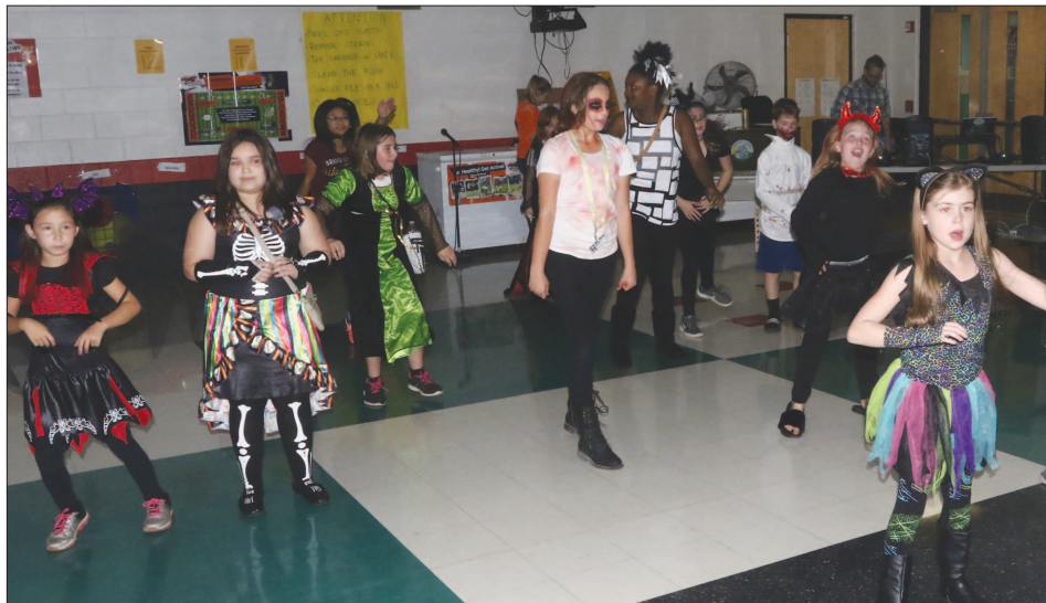
Costumed participants danced the 'cupid shuffle' in the lunchroom.