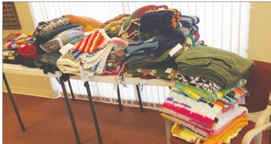
Hand-made lapghans for homeless veterans.

During January and February 2020 the group will be working on our women's and children's needs and encourages anyone that does knitting and crocheting and would like to learn, to come and join the group at the Senior Center on Thursday mornings at 9 a.m.