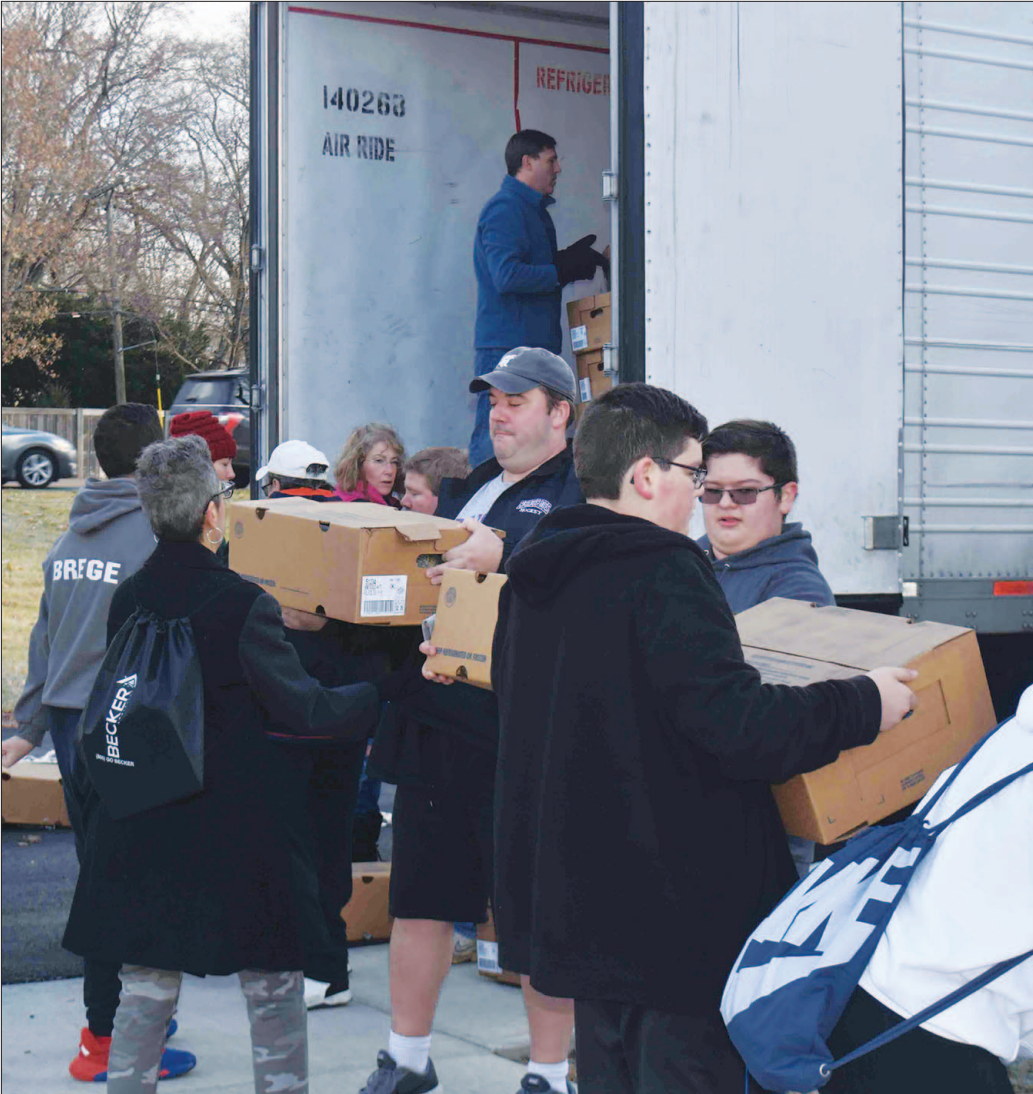
An assembly line was needed to unload two thousand frozen turkeys off a refrigerated truck and into the gymnasium for packing.