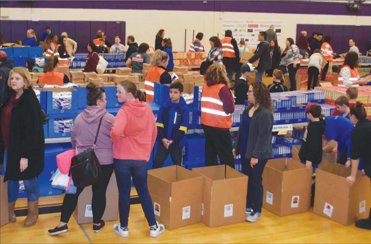
The gymnasium at Tefft Middle School was filled with over 700 volunteers that filled 2,000 boxes with holiday food.