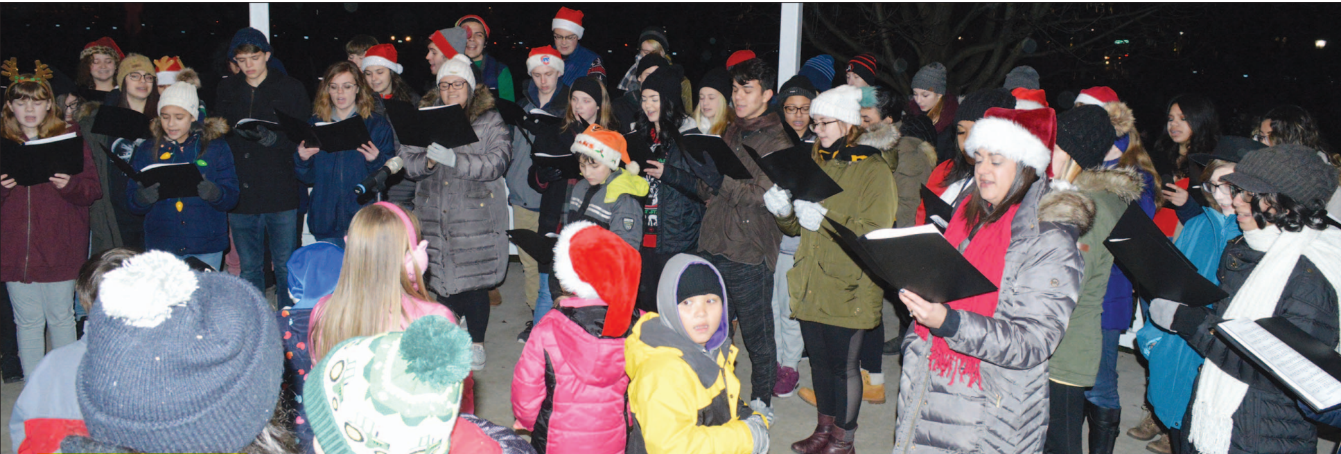
The South Elgin High School choir sang Christmas carols to entertain the crowd before the tree lighting ceremony.