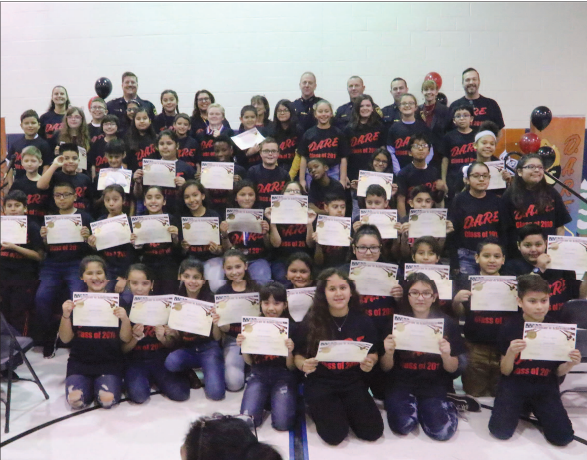
Sunnydale Elementary's D.A.R.E. graduating Class of 2018.

mony featured dancing demonstrations, presentation of diplomas, a slide show of photos taken during the course, a song sung by students and refreshments provided by the PTO. The PTO also, along with the police department, contributed to the purchase of D.A.R.E. T-shirts.