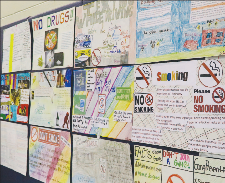
The public service announcements students made during the D.A.R.E. course were on display in the gym.