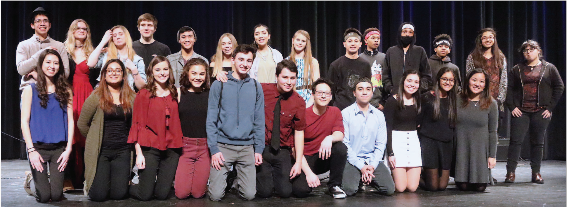
Students representing all 15 acts gathered on stage following the show.