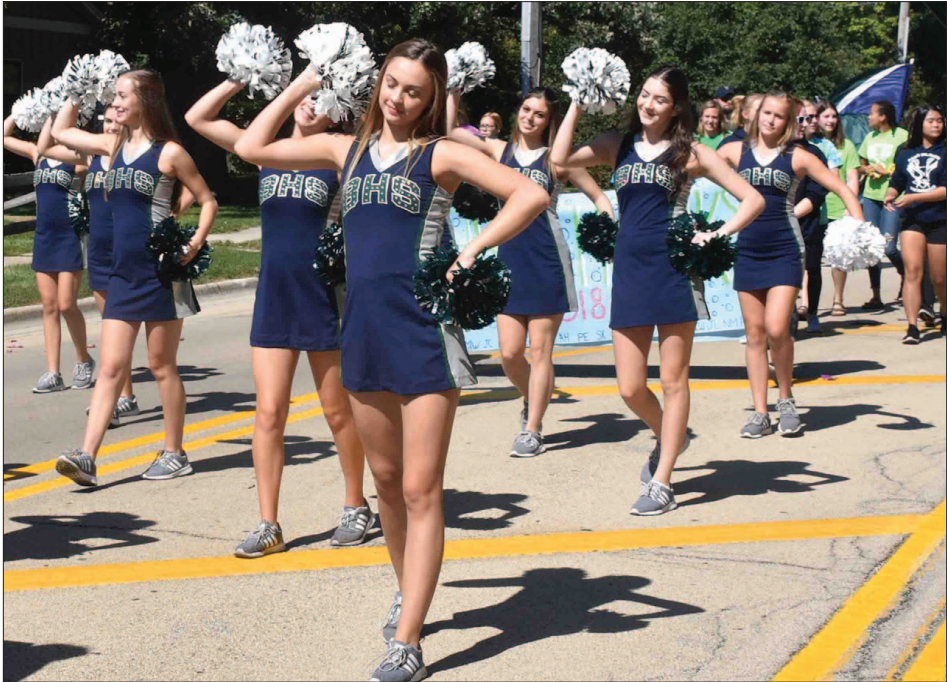
The varsity dance team showed off their moves to the crowd as they marched down the parade route.