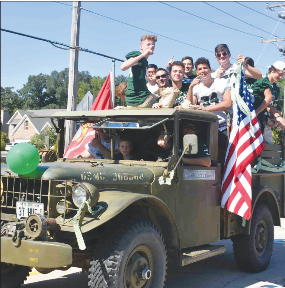
Members of the football team rode down the parade route in an antique military truck.