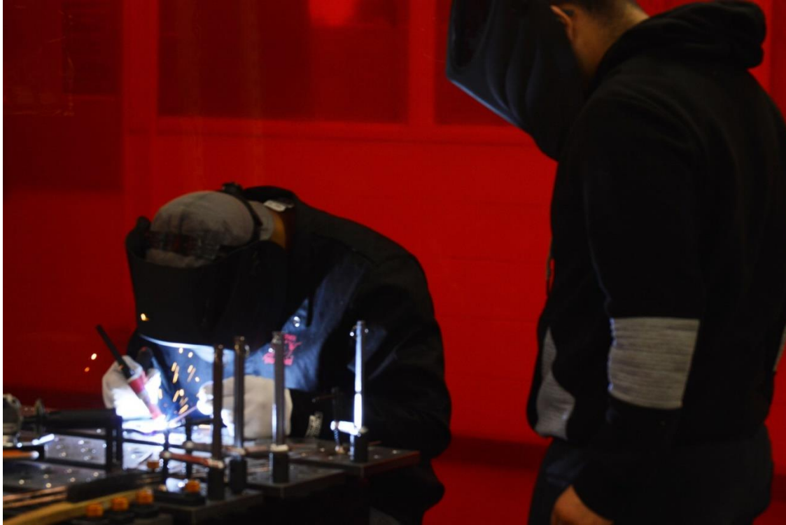
A student works on TIG welding at the Elgin High School welding lab on April 26.

School District U46 high schools will each have five career academies and one magnet academy beginning in the 2021-22 school year, district officials said Monday.