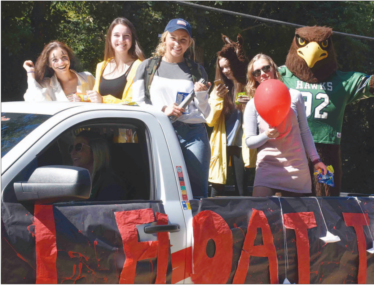
The senior class officers and The Hawk rode in their truck with the main color being red as their float represented the movie 'IT.'