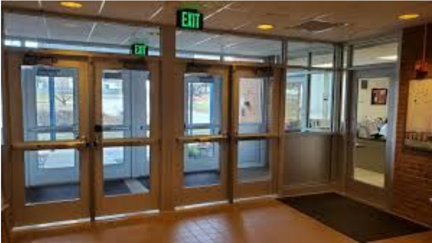
Secure Entry Ways