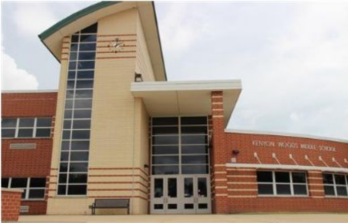
Kenyon Woods Middle School