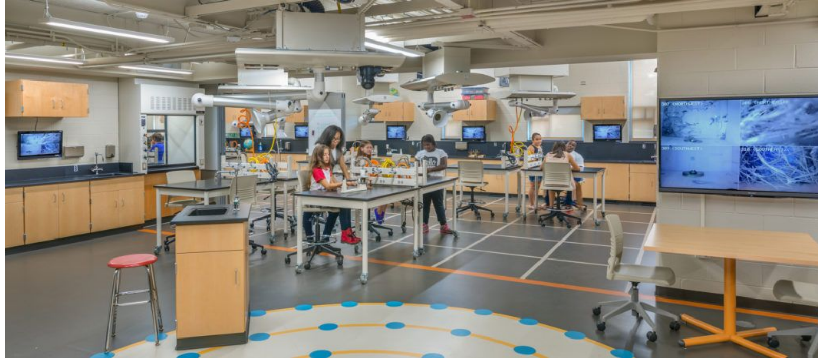
Updated Science Labs