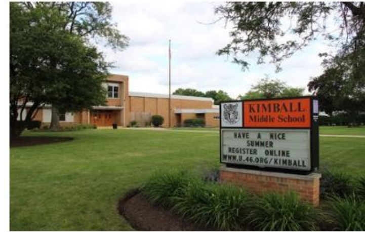
Kimball Middle School