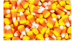
FALL FESTIVAL OCTOBER 30TH