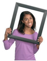
PICTURE DAY OCTOBER 5TH