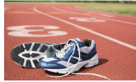
ROCK THE WALK OCTOBER 16TH