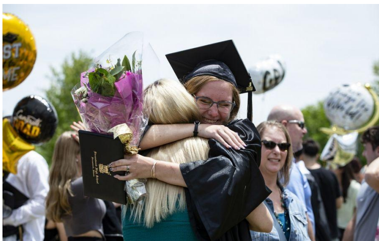
Streamwood High School held its graduation ceremony on Saturday, May 27, 2023 at the Now Arena in Hoffman Estates.