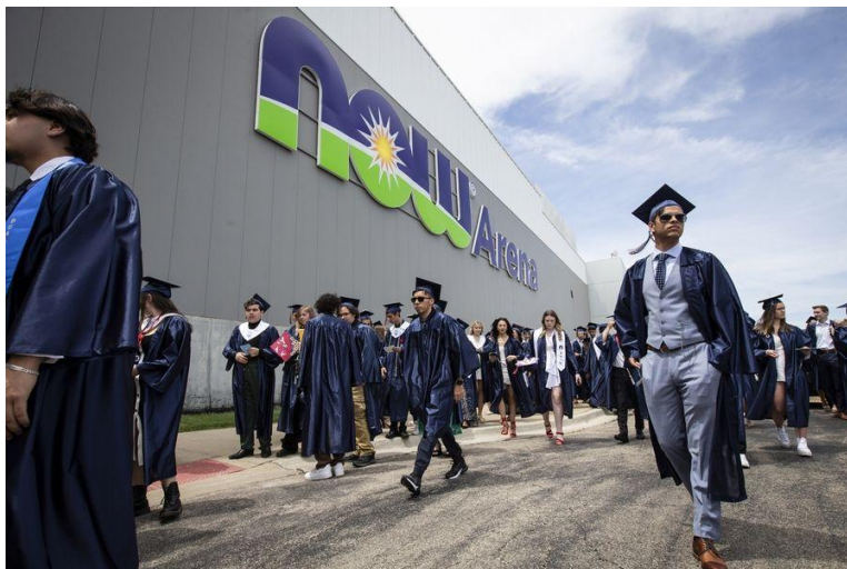
South Elgin High School held its graduation ceremony on Saturday, May 27, 2023 at the Now Arena in Hoffman Estates.