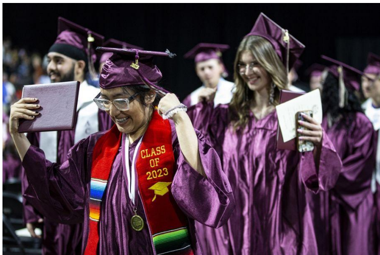
Elgin High School held its graduation ceremony on Saturday, May 27, 2023 at the Now Arena in Hoffman Estates.