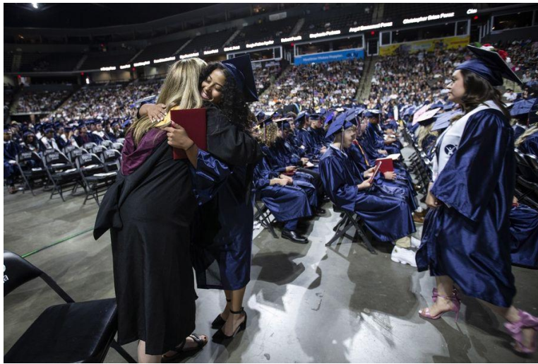
South Elgin High School held its graduation ceremony on Saturday, May 27, 2023 at the Now Arena in Hoffman Estates.