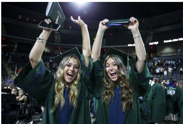
Bartlett High School held its graduation ceremony on Saturday, May 27, 2023 at the Now Arena in Hoffman Estates.