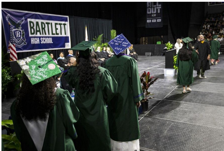
Bartlett High School held its graduation ceremony on Saturday, May 27, 2023 at the Now Arena in Hoffman Estates.