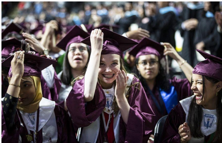
Elgin High School held its graduation ceremony on Saturday, May 27, 2023 at the Now Arena in Hoffman Estates.