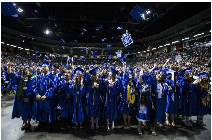
Larkin High School held its graduation ceremony on Saturday, May 27, 2023 at the Now Arena in Hoffman Estates.