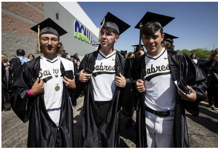
Streamwood High School held its graduation ceremony on Saturday, May 27, 2023 at the Now Arena in Hoffman Estates.