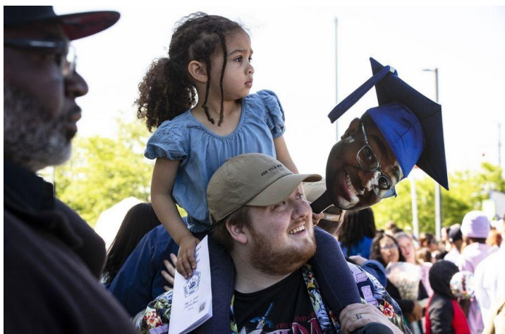
Larkin High School held its graduation ceremony on Saturday, May 27, 2023 at the Now Arena in Hoffman Estates.