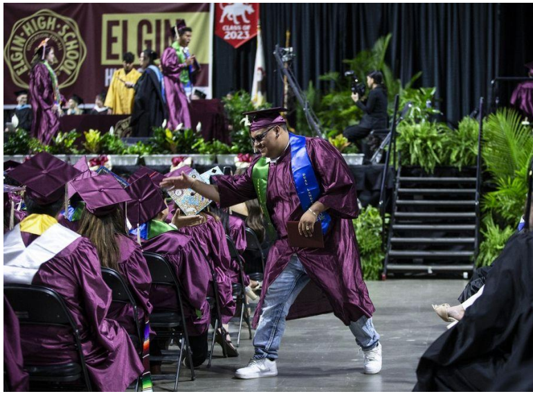
Elgin High School held its graduation ceremony on Saturday, May 27, 2023 at the Now Arena in Hoffman Estates.