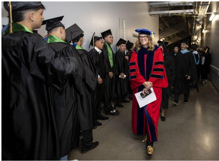
Streamwood High School held its graduation ceremony on Saturday, May 27, 2023 at the Now Arena in Hoffman Estates.