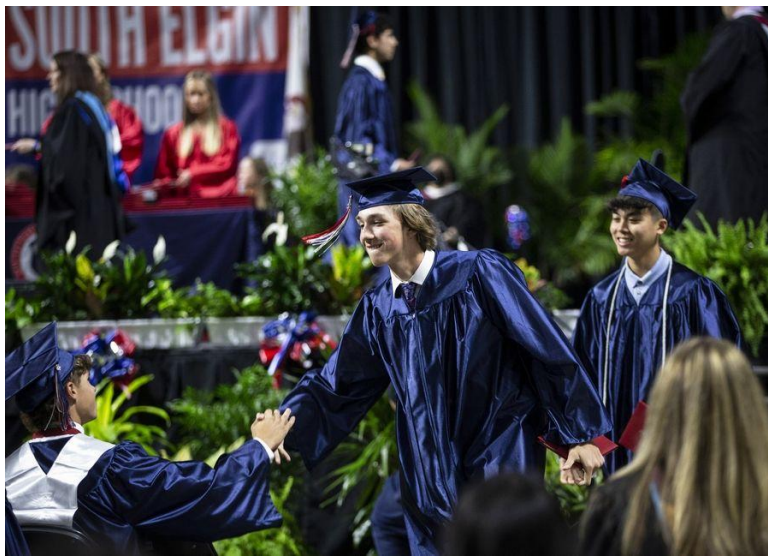
South Elgin High School held its graduation ceremony on Saturday, May 27, 2023 at the Now Arena in Hoffman Estates.