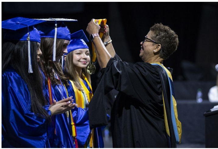
Larkin High School held its graduation ceremony on Saturday, May 27, 2023 at the Now Arena in Hoffman Estates.