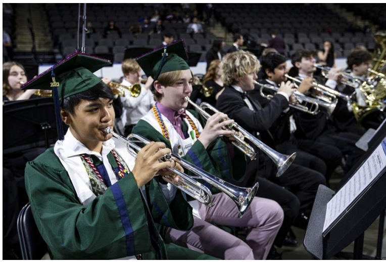
Bartlett High School held its graduation ceremony on Saturday, May 27, 2023 at the Now Arena in Hoffman Estates.