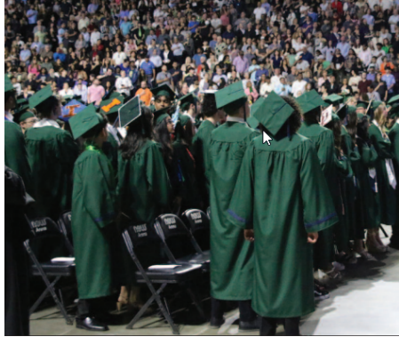
Class of 2024 students look to their parents in the audience