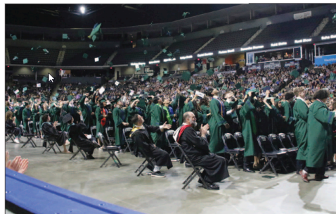
The Class of 2024 celebrates their last day of high school by tossing their caps into the air.