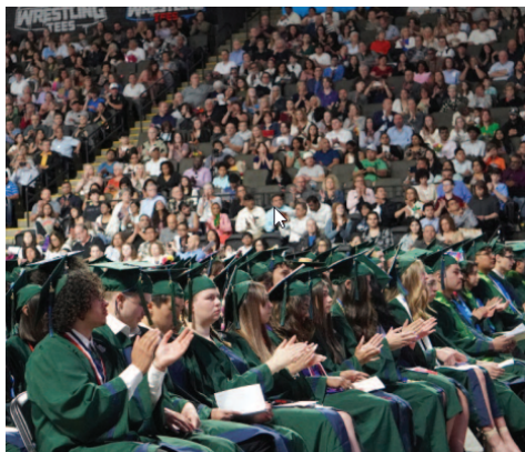
Students applauding speakers.