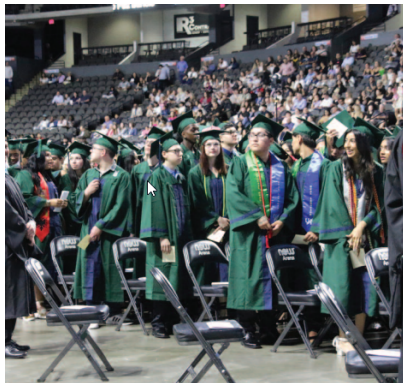
Students in the Class of 2024 look at the seated audience