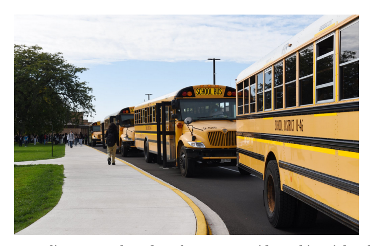
Buses line up on Thursday afternoon outside Larkin High School in Elgin.

Days that start at 5:15 a.m. and end at 4:45 p.m. Workplace temperatures that hit 120 degrees in the summer. The possibility of being kicked, punched or slapped. Confrontations with students in possession of illegal drugs. Take home pay of $585 every two weeks.