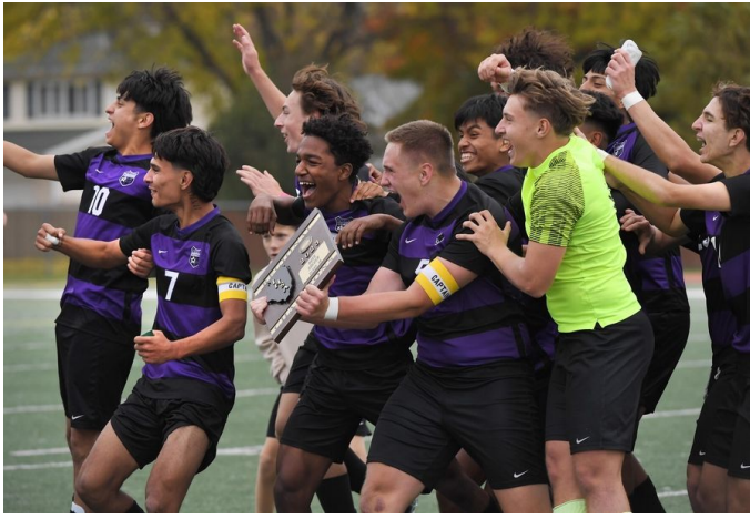
Rolling Meadows celebrates their boys soccer regional championship after defeating Prospect in Arlington Heights on Saturday, October 21, 2023.