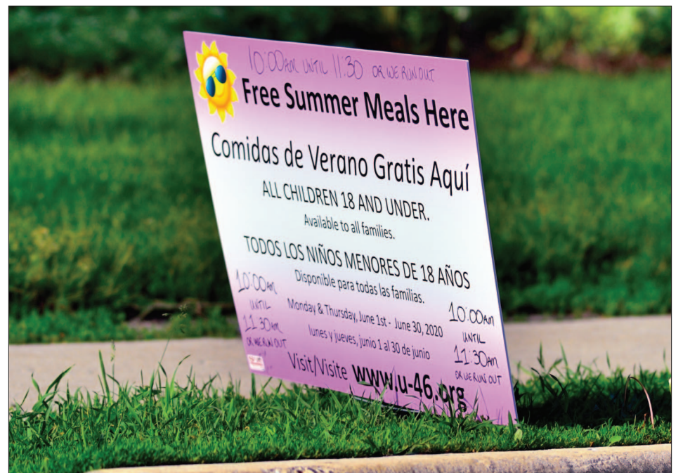
A sign in front of South Elgin's Willard Elementary School announcing the continuation of the free U-46 meals program being extended into summer. The meals will be available at all schools throughout the district.