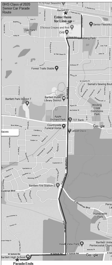
Bartlett High School class of 2020 parade route on Saturday, June 13.

Photographers will be positioned along the parade route, and photos will be available for downloading from site links posted on the Bartlett High School Parents/Students Class of 2020 Facebook page, which seniors and their parents may access for any additional updates.