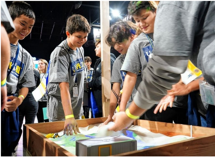
A sandbox with a topographic map beamed onto it from a digital projector, presented by the civil engineering firm HLR, was a big draw for U-46 eighth-grade students at Explore 2022.