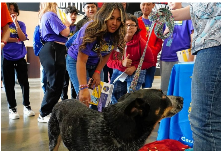
Elgin Area School District U-46 eighth-graders enjoy a visit from Monte as part of a presentation by the Veterinary Assistant Program at Burlington Central Unit District 301, which is available to U-46 students.

About 60 local businesses, industries, governmental organizations, and nonprofits had exhibits at Explore and representatives who engaged in discussions with students. In addition, each of the district's five Magnet Academies had exhibits, teachers, and high schoolers present to talk to the students (the application process for Magnet Academies is now open to eighth-graders) and U-46's culinary, health sciences, automotive, welding and precision manufacturing programs were represented as well.