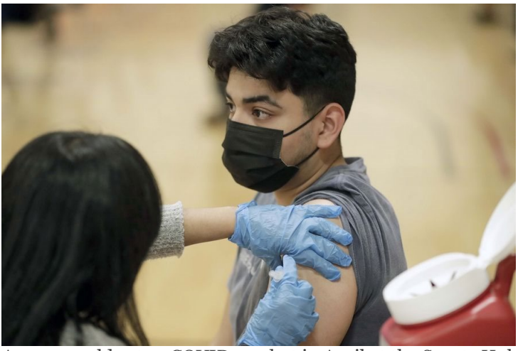
A 17-year-old gets a COVID-19 shot in April at the Sports Hub in Glendale Heights.

With most suburban schools in full swing amid a spike in COVID-19 infections, state data Friday showed that less than half of young Illinoisans ages 12 to 17 are fully vaccinated.