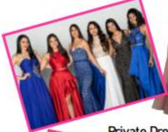
Private Dressing Rooms