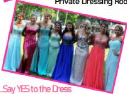
...Say YES to the Dress