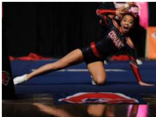
Conant High School placed sixth in the coed team division at the IHSA Competitive Cheerleading finals Saturday in Bloomington.

This article has been updated to correctly report that Jacobs High School finished 6th in the large team division of the IHSA Competitive Cheerleading state finals.