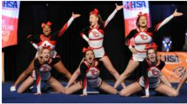
Cheerleaders from Timothy Christian High School in Elmhurst compete at the IHSA Competitive Cheerleading finals Saturday in Bloomington. They ended up finishing 10th in the small team division.