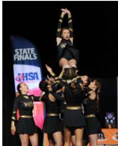
Cheerleaders from St. Edward Central Catholic High School in Elgin placed third in the small division at the IHSA Competitive Cheerleading finals Saturday in Bloomington.