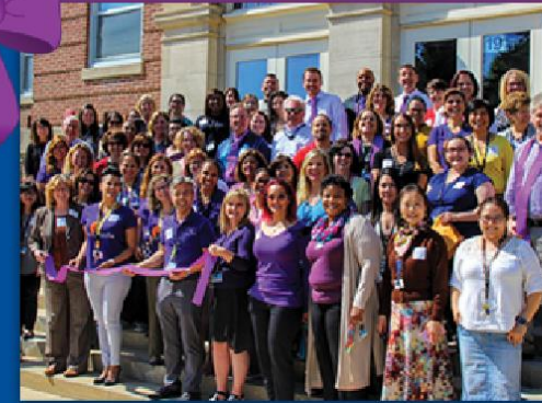
District Office Trauma Informed Care Day, 2019