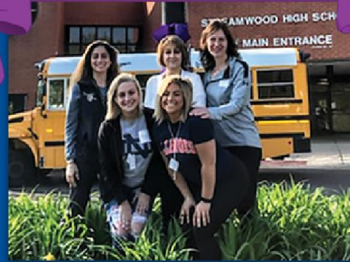
Streamwood High School Trauma Informed Care Day, 2019