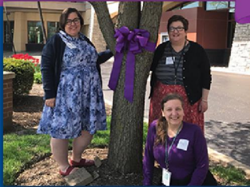
Gail Borden Public Library, Trauma Informed Care Day Celebration, 2019