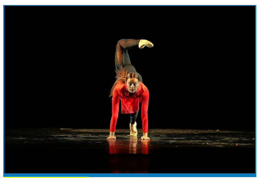
Larkin High School's Visual and Performing Arts Dance Academy's Bring a Book to Life performance returns this week with "Mr. Men Little Miss."