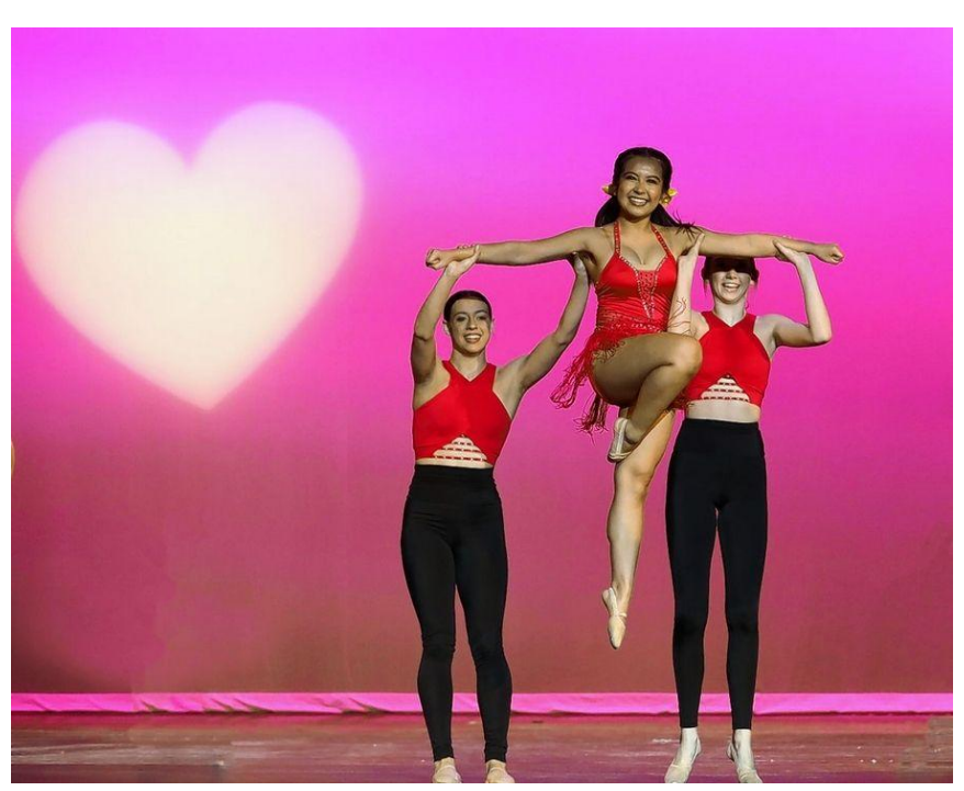
Larkin High School's Visual and Performing Arts Dance Academy's Bring a Book to Life performance returns this week with "Mr. Men Little Miss."

Larkin High School's VPAA Dance Academy's Bring a Book to Life performance returns this week with "Mr. Men Little Miss," a dance production based on the "Mr. Men and